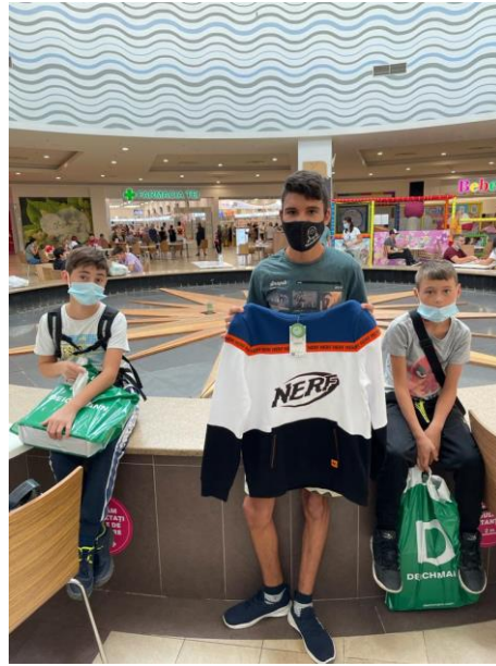
(↑) Shopping session for our boys 😊