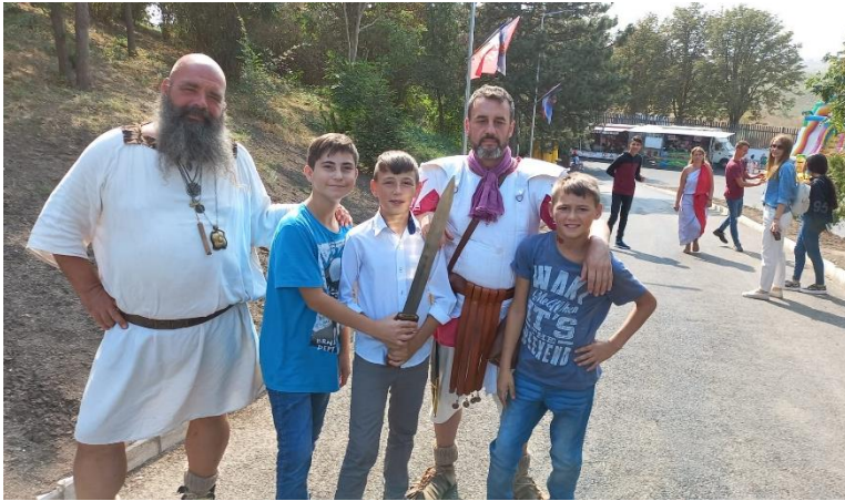
(↑) A historical event in Medgidia our boys were part of in September